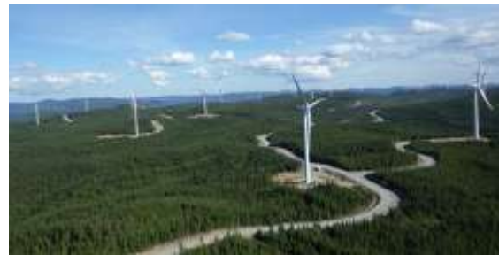
Rivière-du-Moulin Wind Farm