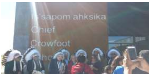
Grand Opening–Chief Crowfoot School–