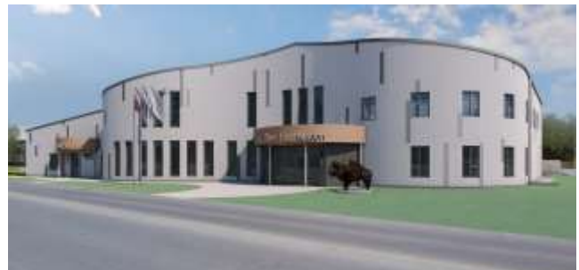
Salt River FN-Community Centre (rendering)