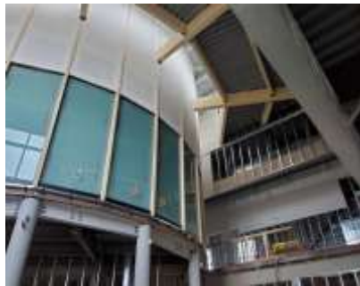
Kahkwistahaw – Governance