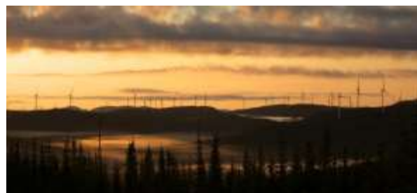
Rivière-du-Moulin Wind Farm