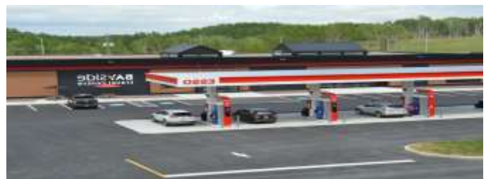
Bayside Travel Centre