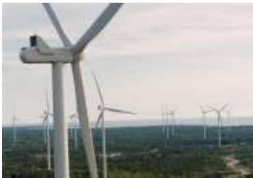
Henvey Inlet Windfarm –FIT