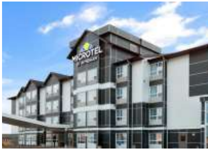
Long Plain Microtel