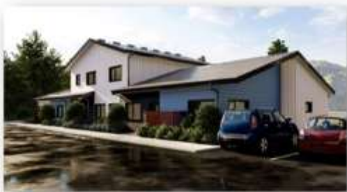
TZEACHTEN HOUSING PROJECT