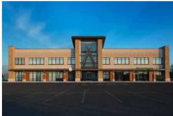
Enoch River Cree–East Office

Beaver Lake Cree Bigstone Cree Cold Lake Driftpile Enoch Cree #440 Fort McMurray #468 Frog Lake Kehewin Cree Little Red River Cree Montana O'Chiese Paul Siksika Sunchild Stoney Swan River Tsuu T'ina